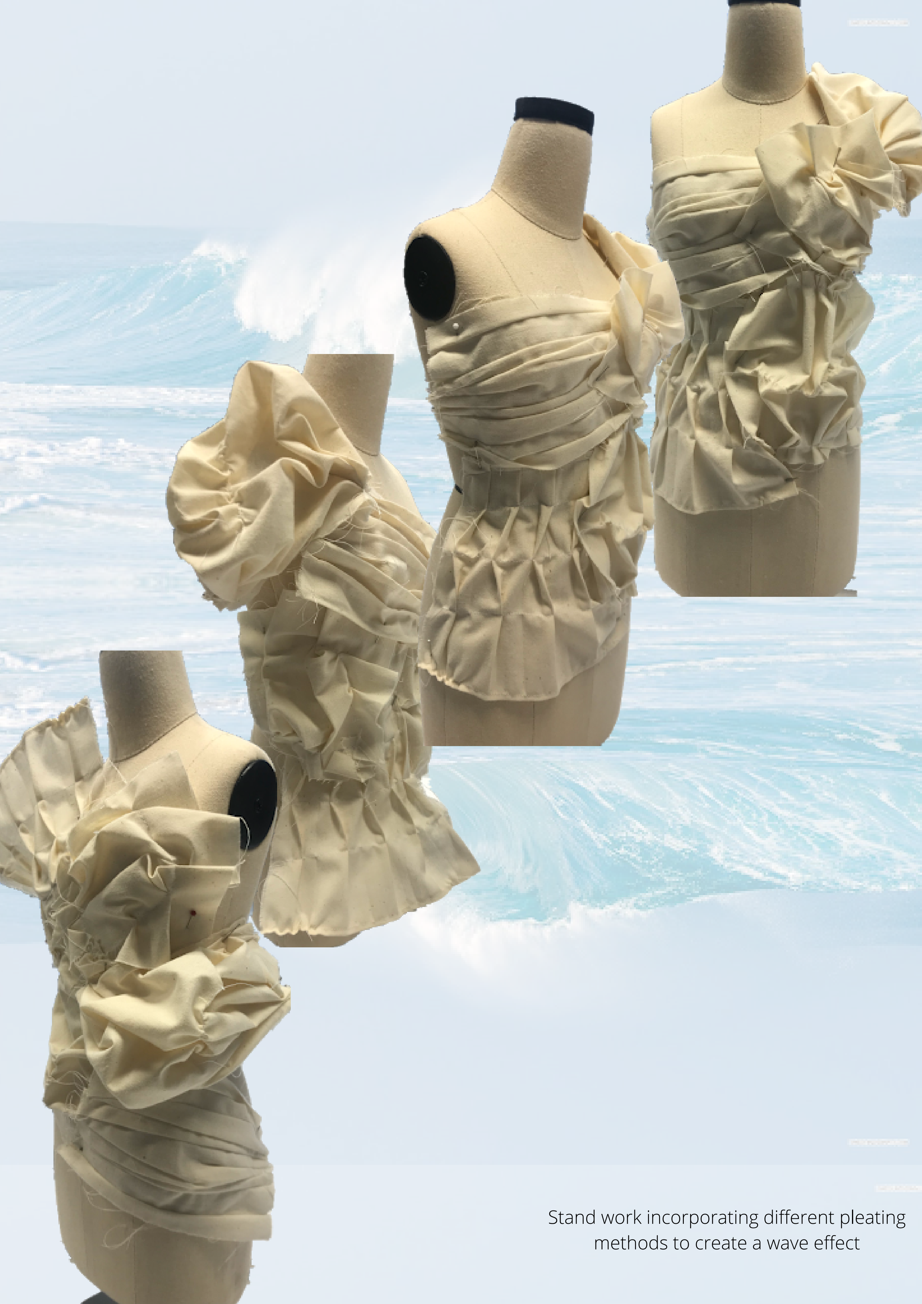
Stand work incorporating different pleating methods to create a wave effect