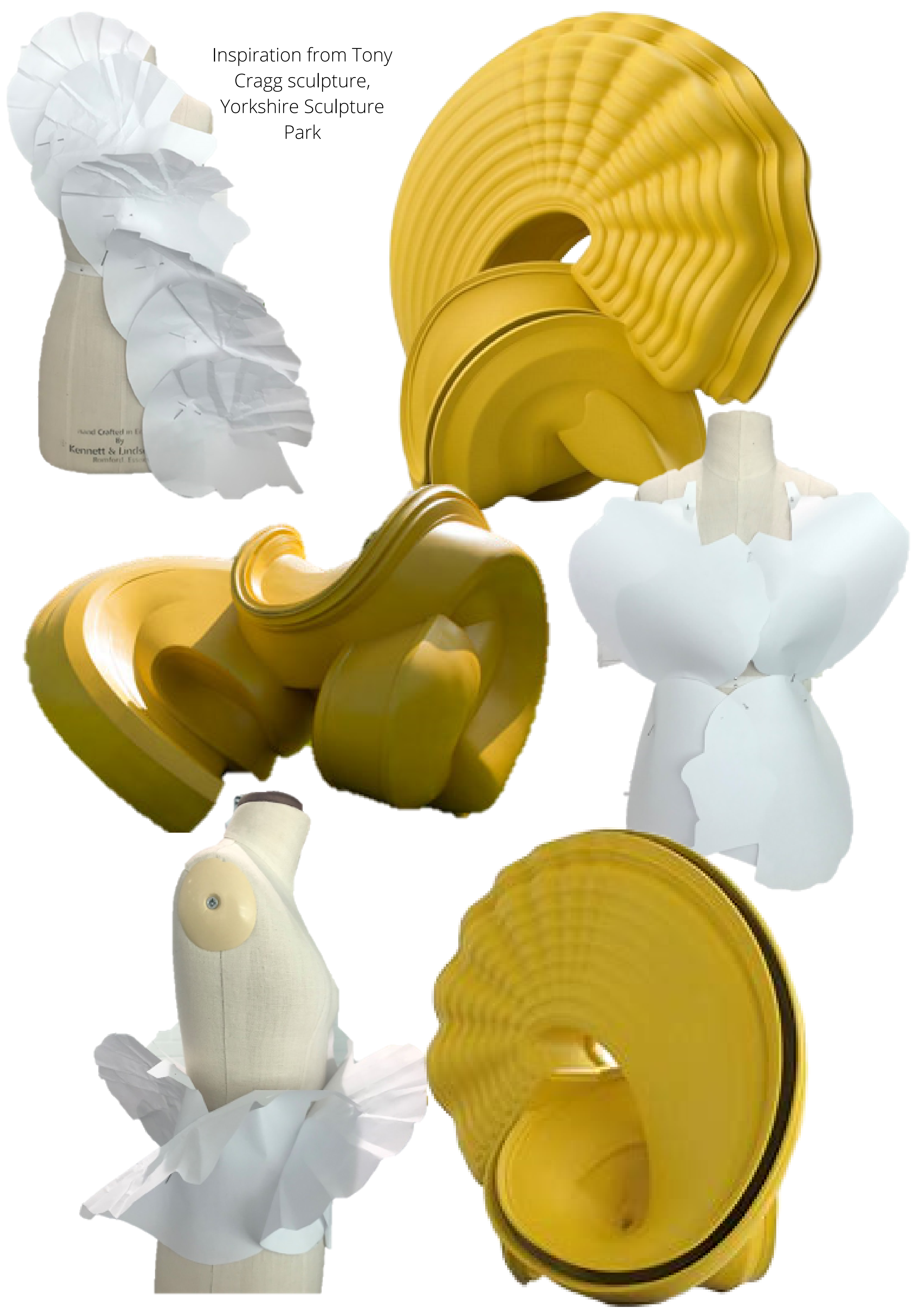
Inspiration from Tony Cragg sculpture, Yorkshire Sculpture Park