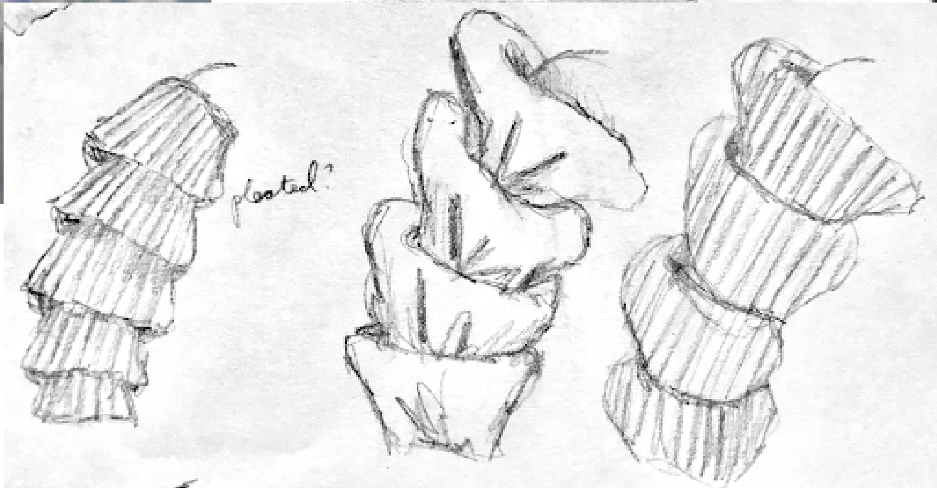
Sleeve development sketches influenced by wave layers